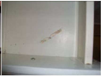
Adhesive mark to bottom of draw unit left of hob