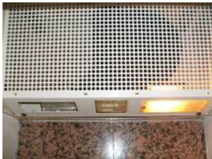
Extractor (1x light not working)