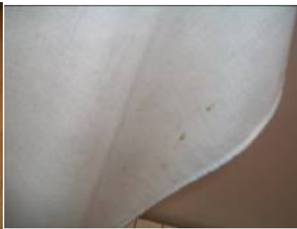
Small marks to bottom of net curtain