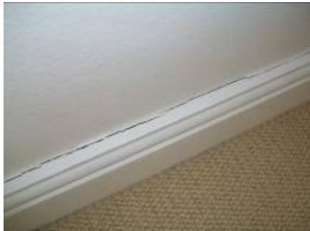
Cracking to top of skirt right of entry