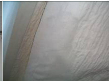
Light purple mark to curtain