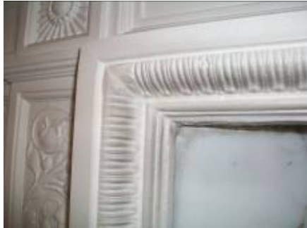
Dark shading to fireplace surround