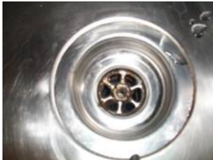
Brown discoloration to waste in sink