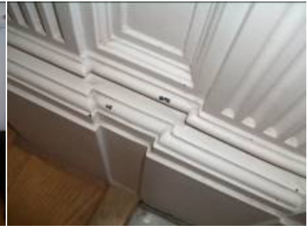
Chipping to paint on fireplace surround left hand side