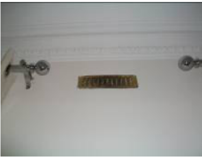
Tarnishing to high level wall vent