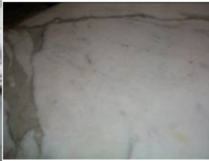
Light surface scratches to fireplace hearth