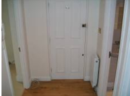
Entrance and hallway