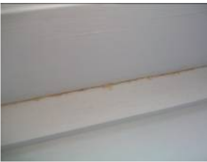
Brown discoloration to window frame low level