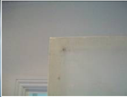
Paint defect to edge of door panel