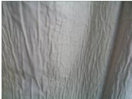
Bubbling to curtain lining