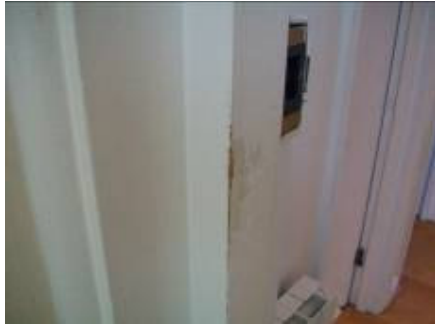
Chipping to paint on exterior door frame mid-level