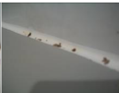
Mould spot marks to sealant around bath tub