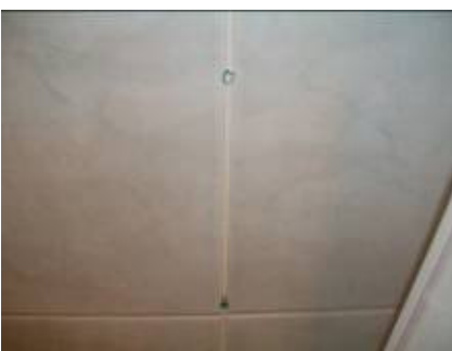
2x fitment holes with rawl plugs to grouting on wall by bath tub