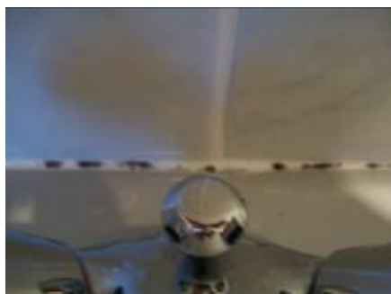
Mould spots to sealant behind mixer tap on washbasin