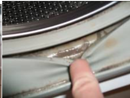
Tarnishing to washing machine seal