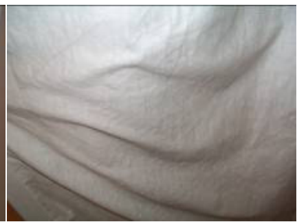
Faint shading to curtain lining to right hand side window frame