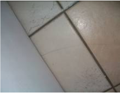
Scratch mark to floor on entry