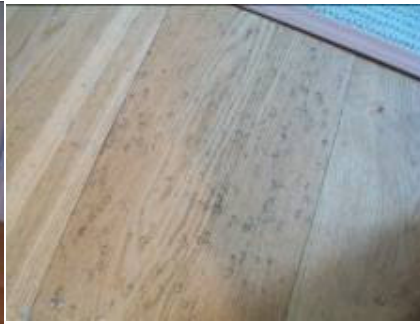
Heel indentations to floor