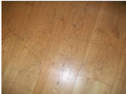
Patch of black scuff marks to floor right of entry