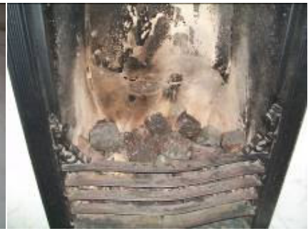
Heavy tarnishing to back of fireplace behind fire basket