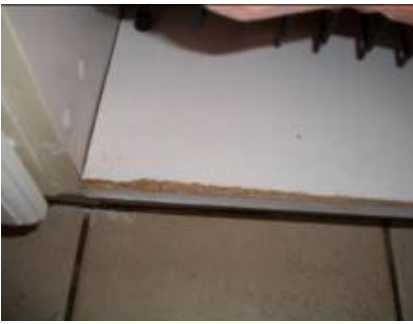
Warping and peeling to laminate edge at base of unit below sink