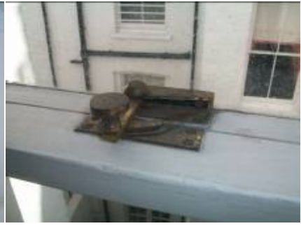
Tarnishing to brass twist lock on window frame