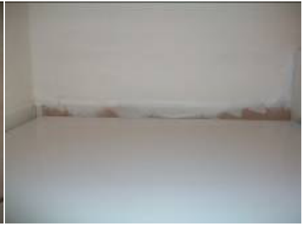
Un-painted section of wall behind fridge