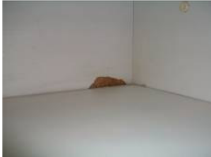
Chip to interior back board of cupboard above oven