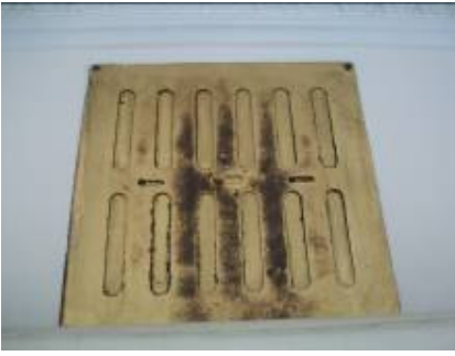
Tarnishing to brass wall vent